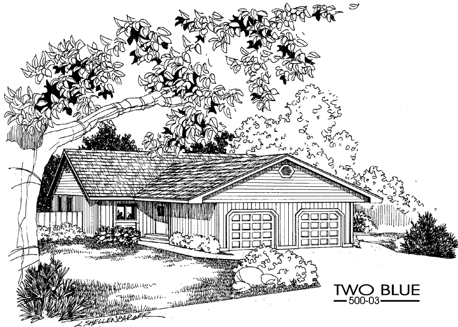
TWO BLUE 500-03

Duplexes are becoming more popular as they provide a side for the owner to live in and sides to either rent out or have an in-law live in for safety and care. The Two Blue (500-03) is just such a unit. While each side is a mirror of the other, they provide an excellent use of space and give each family a three-bedroom home with a “great room” out of the living and dining room areas. Each unit has 1,144 square feet of living area.